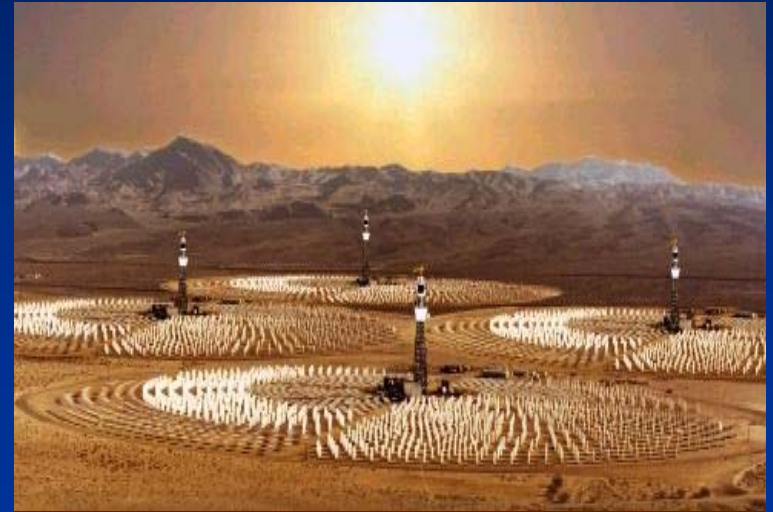
Advanced "Power Tower" Design New Demo Projects in Spain