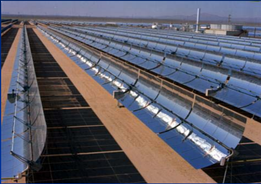
350 MW of "Parabolic Trough" Operating 15 Years Mojave Desert, Calif.