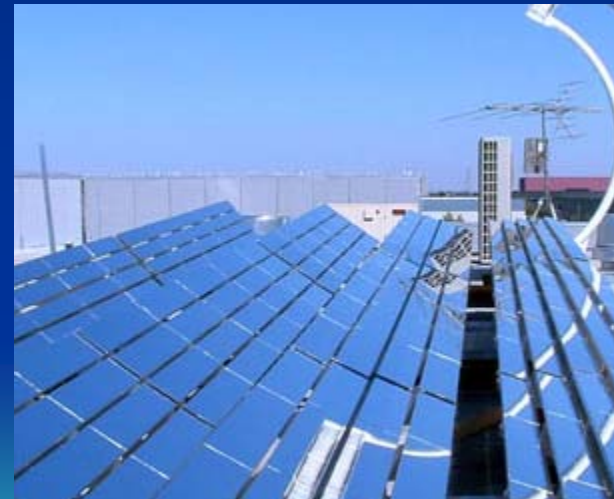
Combined Solar Heat & Power System