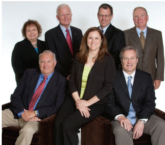
ACEC Business Insurance Trust (BIT)