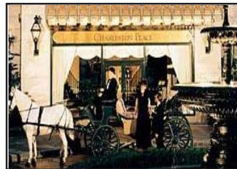
The Charleston Place Hotel, Charleston, SC September 18-21, 2006