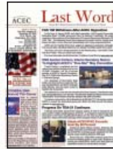
#1 Rated Weekly Newsletter