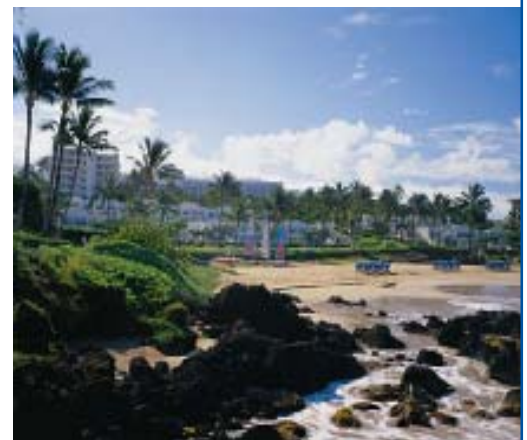
Fairmont Beach, one of Maui's spectacular beaches.