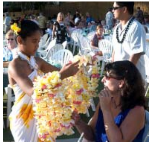
An island girl offers an Hawaiian lei to a Fall Conference guest during the Local Color Night luau.