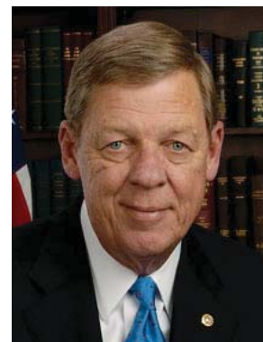
Sen. Johnny Isakson (R-GA)