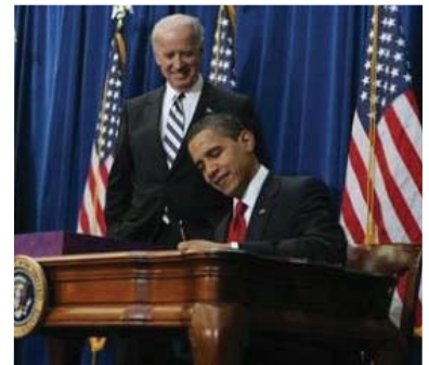
President Barack Obama signs into law the $789 billion economic stimulus package as Vice President Joe Biden observes.