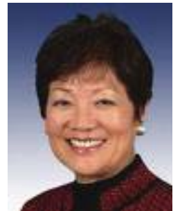
Rep. Mazie Hirono (D-HI)