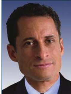
Rep. Anthony Weiner (D-NY)

The Bank would evaluate and finance infrastructure projects with substantial regional and national significance. These projects would be limited to public mass transit systems, public housing, roads, bridges, drinking water and sewage treatment systems.