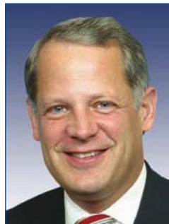
Rep. Steve Israel (D-NY)

Representatives Rosa DeLauro (D-CT), Steve Israel (D-NY), Keith Ellison (D-MN), and Anthony Weiner (D-NY) recently introduced the National Infrastructure Development Bank Act of 2009 (HR 2521).