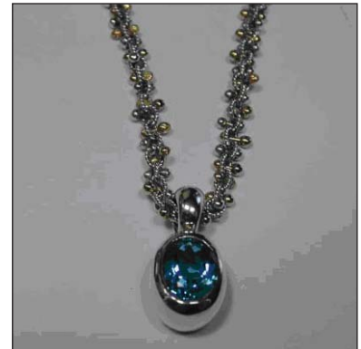
Early Fall Conference registrants have a chance to win this 3.5-karat blue topaz necklace valued at $1,250.

Register today for this important industry event. Click here for more information on the Fall Conference, the drawing for the topaz necklace, and to register.