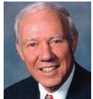
Rep. James Oberstar (D-MN) is moving quickly on the Surface Transportation Authorization Act of 2009.

The recommendations were made at a hearing to review the Obama Administration's newly issued federal contracting initiatives. Attended by many industry representatives, the hearing was moderated by the Office of Management and Budget and the Federal Acquisition Regulation (FAR) Council Leadership—which includes representatives from NASA, GSA and the DoD.