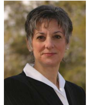
Rep. Allyson Schwartz (D-PA)

ACEC/Hawaii supported the legislation because the tort climate in Ha-