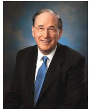
Sen. John Rockefeller (D-WV) sponsored the bill to reauthorize FAA operations and funding.

A vote in the Senate is expected later this year.