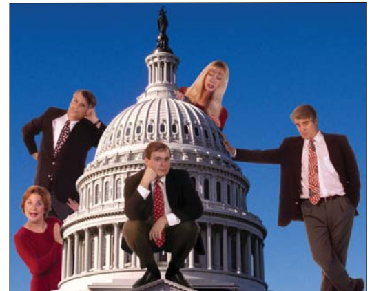
The Capitol Steps comedy troupe will poke good-natured fun at our elected representatives and political process.

Federal agencies have been directed by executive orders and statutes to dramatically reduce energy use over the next several years. In the session titled Federal Agency Business Opportunities in Energy Efficiency and Renewables , two federal officials and an industry analyst will provide important insights on opportunities in this growing market.