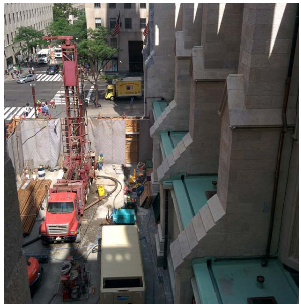
St. Patrick's Cathedral Geothermal Heating & Cooling System P.W. Grosser Consulting Landmark Facilities Group, Inc.

Total = 97.7 quadrillion British Thermal Units Source: U.S. Energy Information Agency, Monthly Energy Review , April 2018