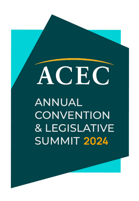
EXHIBIT SPONSORSHIP PROSPECTUS

MAY 13-16, 2024 GRAND HYATT WASHINGTON WASHINGTON D.C.