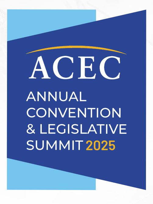
EXHIBIT SPONSORSHIP PROSPECTUS

2025 ANNUAL CONVENTION MAY 18-21, 2025 GRAND HYATT WASHINGTON WASHINGTON, D.C.